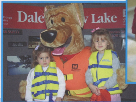
Dale Hollow Lake