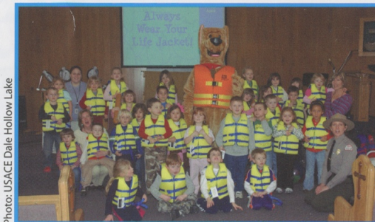
Dale Hollow Lake

While the Foundation encourages all groups to apply for this program, groups that limit the usage to an exclusive membership or club, or that profit from the use of the life jackets, or are otherwise required to provide life jackets are not eligible for participation.