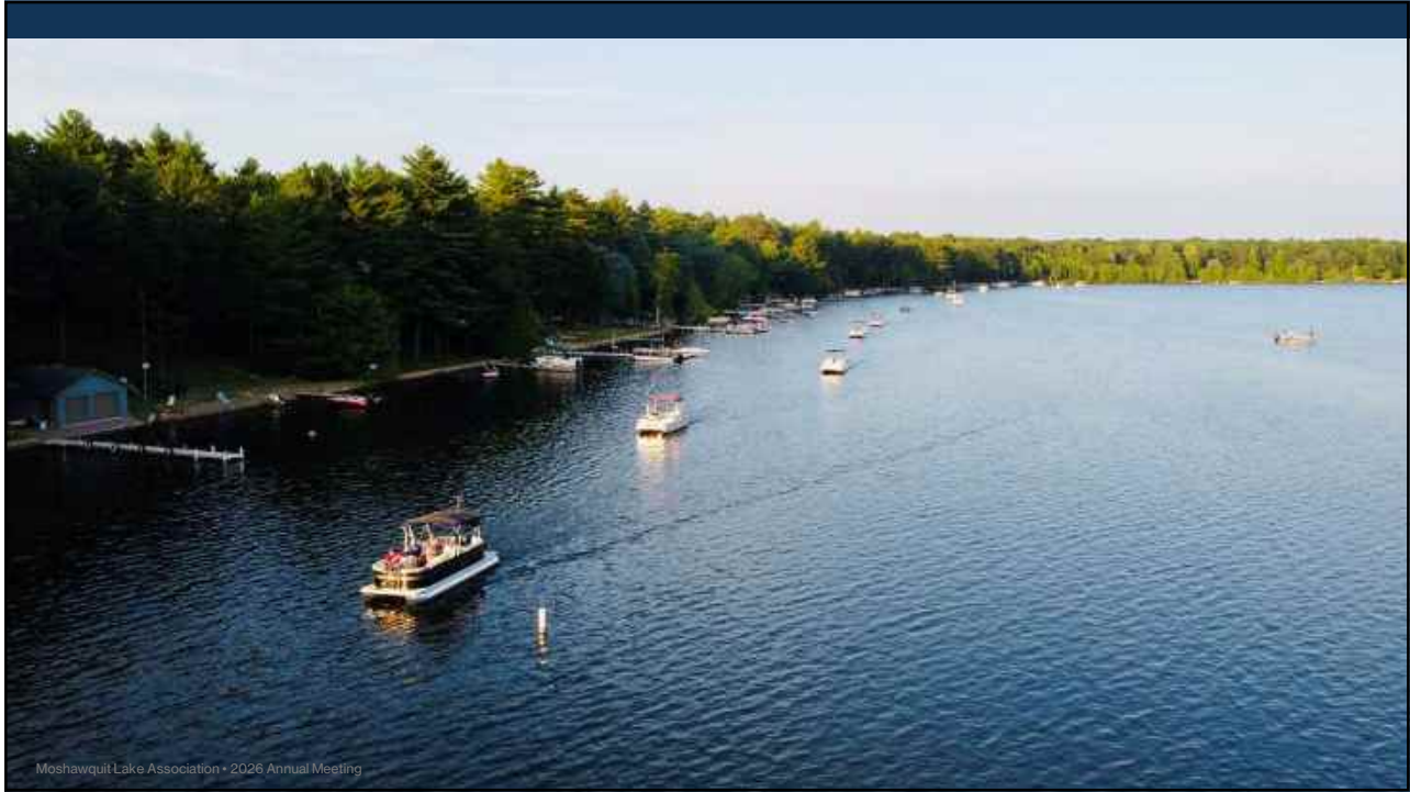
Moshawquit Lake Association • 2026 Annual Meeting